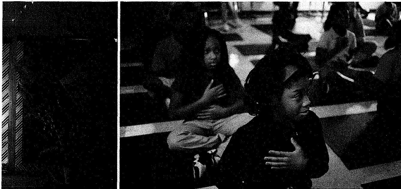
Over the next two years, the Compassionate Schools Project aims to study kids in 50 Louisville public schools